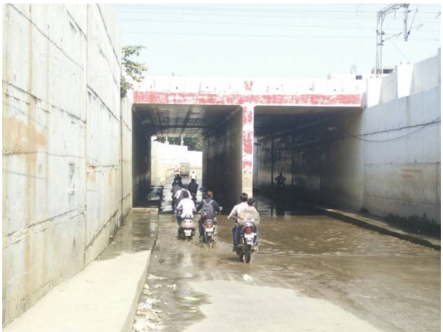
Figure 1: RUB water logging problem (Gujarat, India)

The monsoon is highly important for India as it fills up water reservoirs, replenishes ground water and is essential for the Indian agriculture of which around 70% are rainfed. Every year the newspapers report about the exact date when the rains are expected to start and whether the monsoon has brought more or less rain than in the years before. As the rain falls the water accumulates from the surroundings catchment area i.e. approach road of RUB and gets clogged in it ,this creates problem for the road users during monsoon.